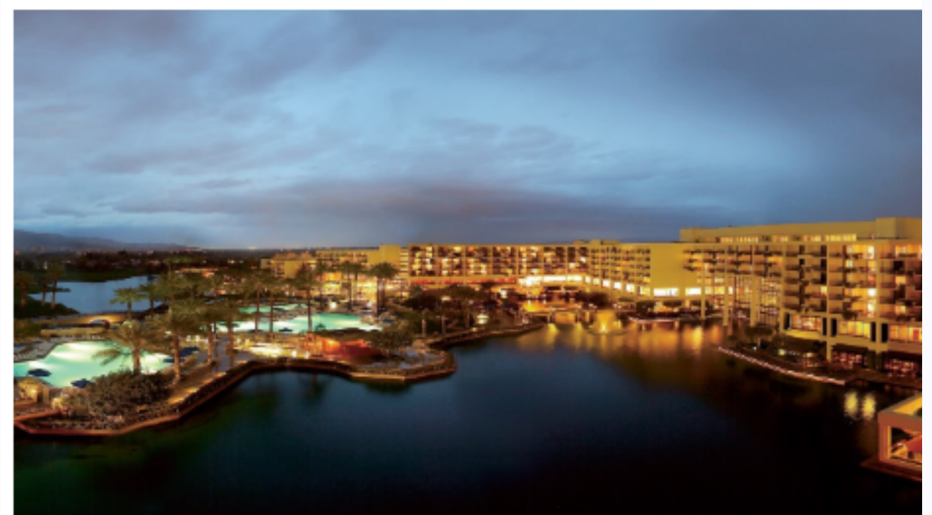
JW Marriott Desert Springs Resort & Spa 74-855 Country Club Dr Palm Desert, CA 92260

Don't miss this opportunity to invest in your district and strengthen our local network. I hope to see you all there!